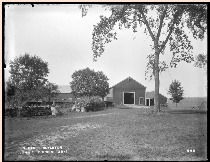
Eminent Domain Taking BARN ON JOHN F. O'BRIEN'S PROPERTY AT THE TIME OF THE METROPOLITAN WATER BOARD TAKING Photograph dated September 11, 1896