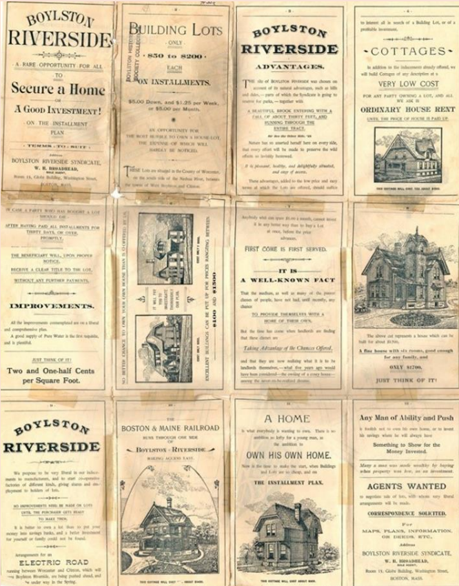
New Development “BOYLSTON RIVERSIDE” Describes house styles and costs February 1892 (front view Advertisement)

At this point, a large portion the property was sold and passed to numerous owners, one of whom had a grand development plan. On February 9, 1892 the Riverside Boylston Syndicate announced a new community to be built along the Nashua River, including 33 lots, two parks, one along the river, a hotel overlooking scenic Dinner Pail Falls , and all this was walking distance of the Boylston train station on the Central Mass Railroad. Advertised as being affordable, it sounded like a dream community.