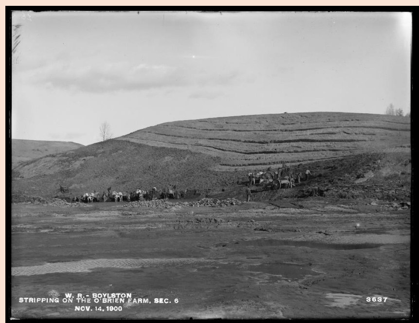
Eminent Domain Taking STRIPPING OF THE O'BRIEN'S FARM METROPOLITAN WATER BOARD TAKING Photograph dated November 14, 1900 Digital Commonwealth Photograph Collection