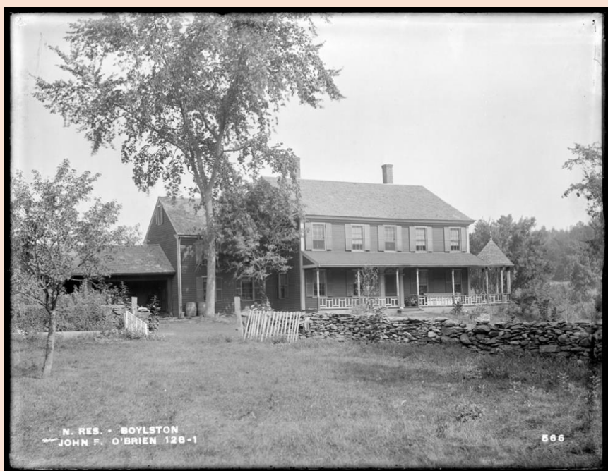
Eminent Domain Taking ONE OF SEVERAL HOUSES AND BARN ON JOHN F. O'BRIEN'S PROPERTY AT THE TIME OF THE METROPOLITAN WATER BOARD TAKING Photograph dated September 11, 1896

According to the March 14, 1900 "Boylston Riverside" Section No. 1 plan, several lots had been marked sold and places for factories had been reserved, but with the eminent domain taking of the last of this property in 1900, the plans for "Boylston Riverside" were not to become a reality.