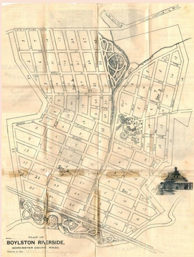
New Development “BOYLSTON RIVERSIDE” House Lot and Industry Layout February 1892 (back view of advertisement)

Just who was behind this plan is unclear but a few of the owners of record had experience building houses. The address given for Boylston Riverside Syndicate was Washington Street, Boston, Massachusetts which was the banking district. Why did this plan arise at the time of the Metropolitan Eminent Domain Taking?